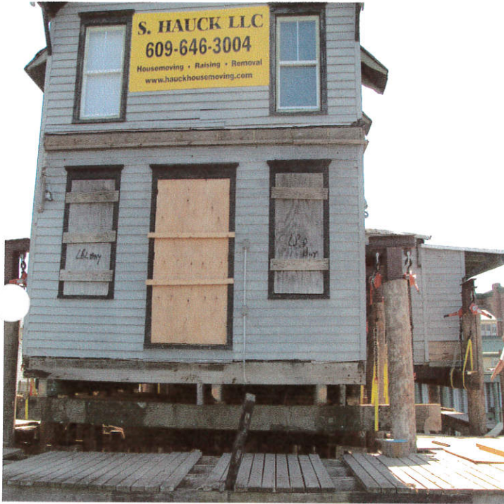
Front View Date Taken:05/19/2009